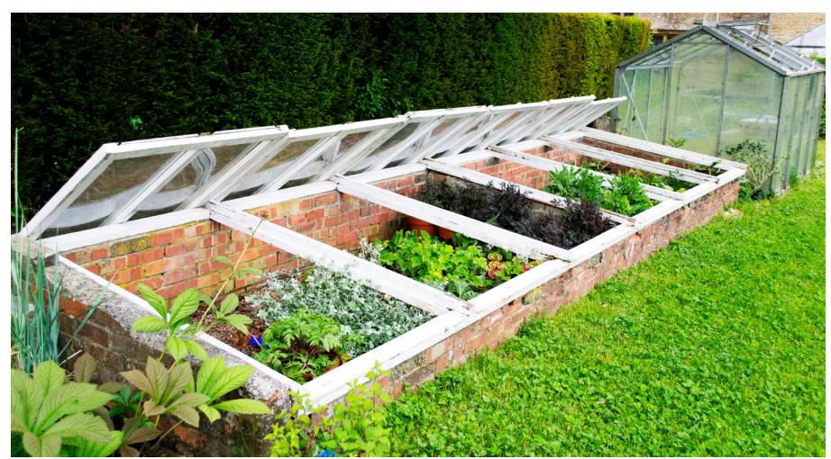
Figure 2. Cold frames extend the growing season