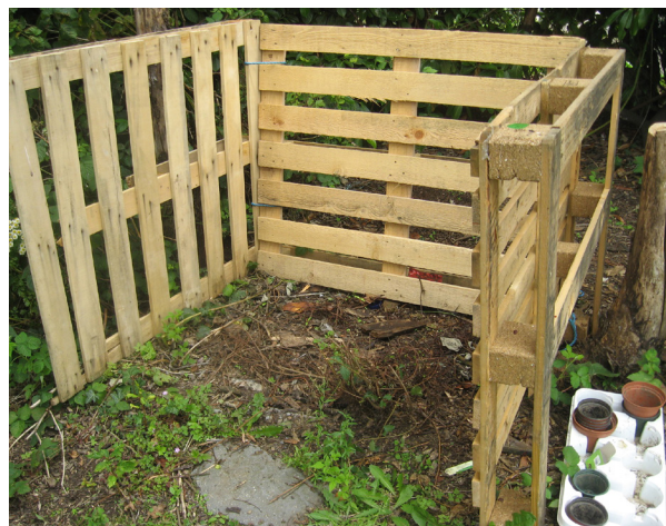
Wooden pallet bin.