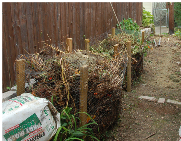
Chicken wire bin.