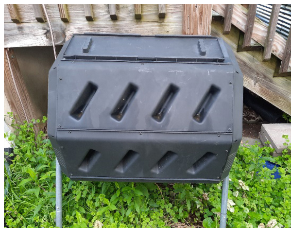
Tumbling compost bin.