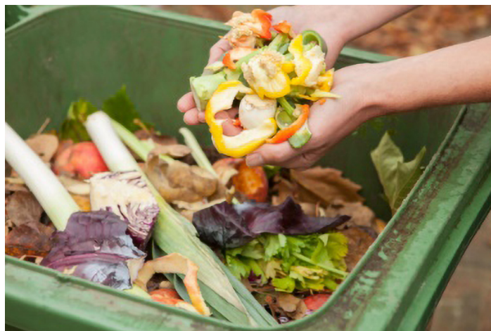
Composting food scraps reduces waste going to landfills.

If you use food scraps in your pile, it can be helpful to bury them in the middle of the pile to discourage pests from visiting your compost pile.